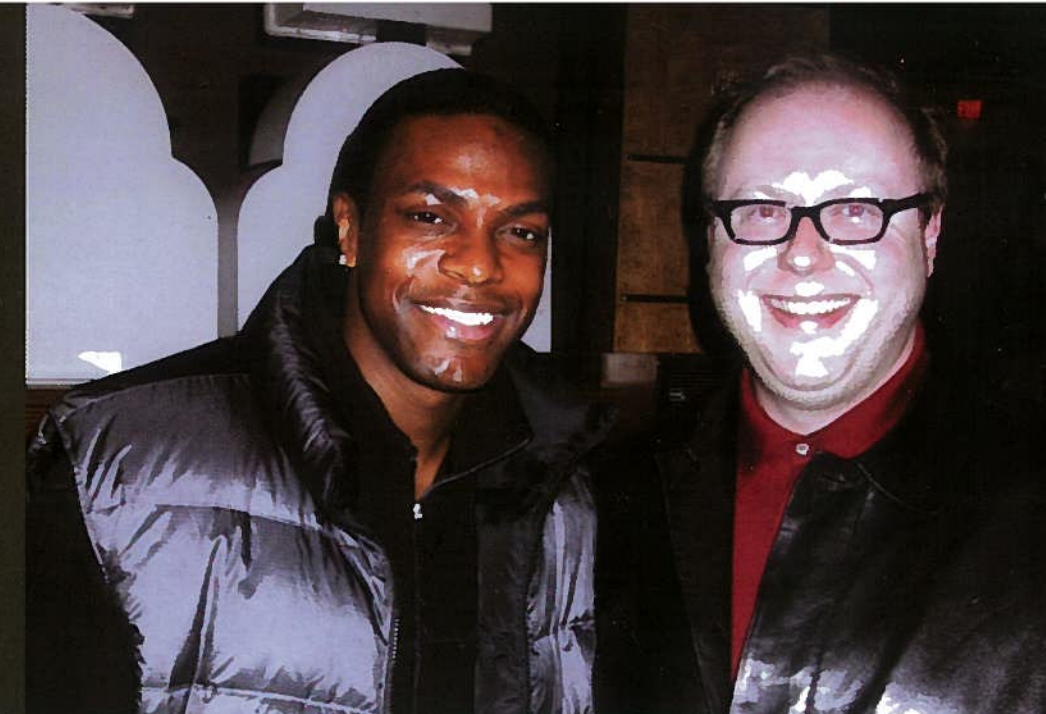
An hour spent with Chris Tucker is a rush.